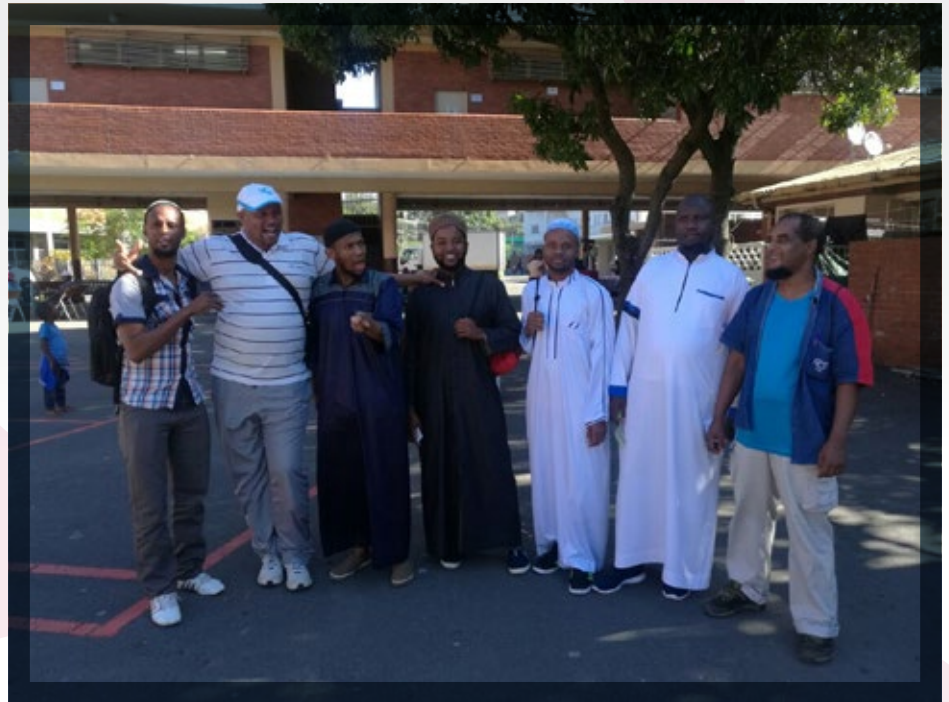
KZN Imams attending the AlKauthar Institute Course Tafseer Surah Taha | KZN Imams at the Young Leaders Academy Workshop