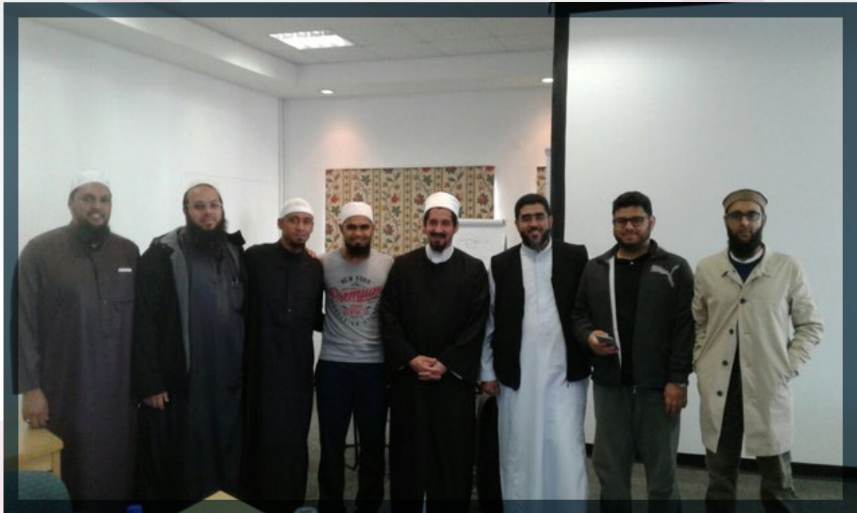
The annual Iman Retreat was held at the Waterval Country Lodge in Tulbagh, Cape Town